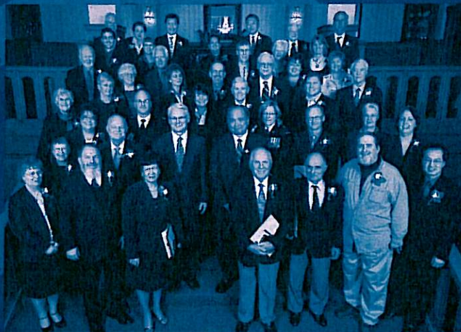
2008 Community Achievement Award Recipients with His Honour, Stephen L. Point, OBC, Lieutenant Governor of British Columbia and The Honourable Gordon Campbell, Premier of British Columbia

BC Community Achievement Awards BC National Award for Canadian Non-Fiction BC Creative Achievement Awards BC Creative Achievement Awards for Aboriginal Art BC Achievement Foundation Award for Early Literacy BC Aboriginal Business Awards